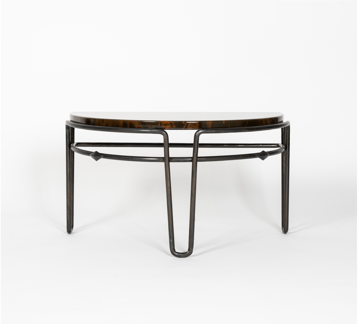
Luna coffee table