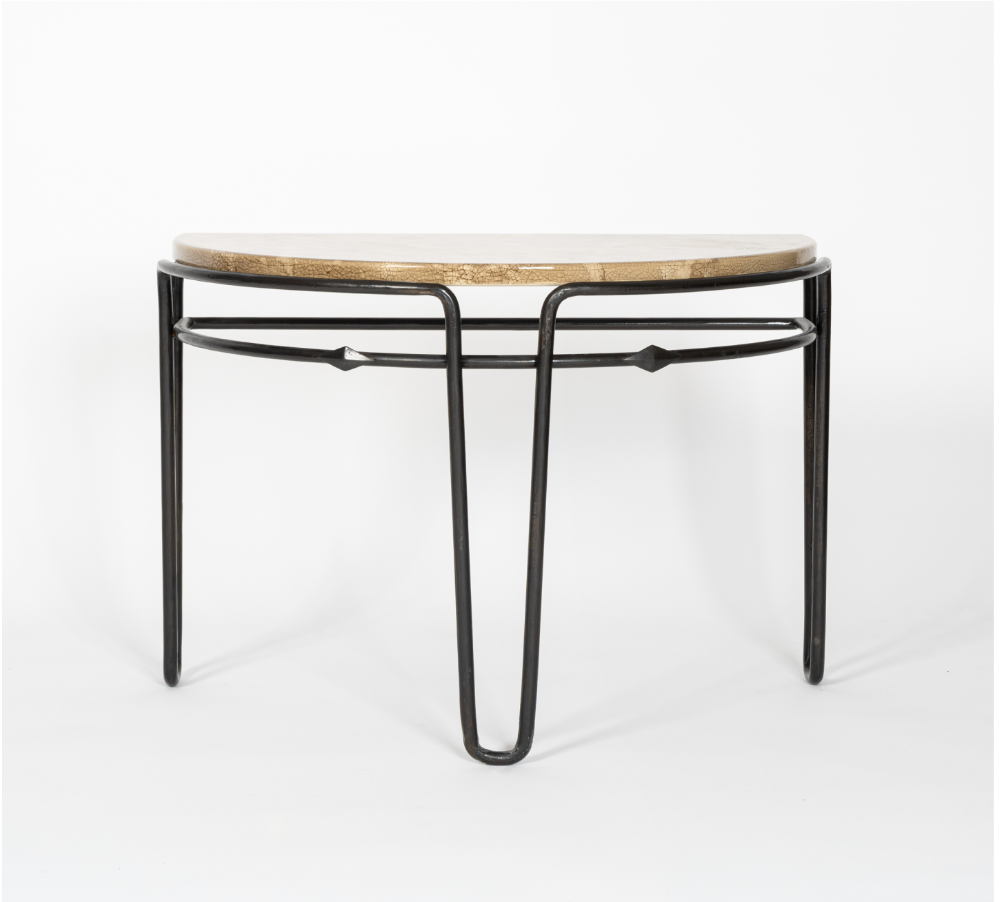
Luna side table