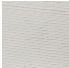
Marble powder plaster