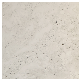
Travertine Navona Honed finish