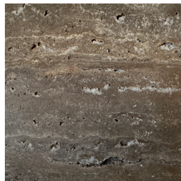
Travertine Titanium Honed finish